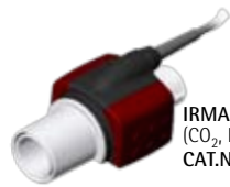
IRMA AX+ (CO 2 , N 2 O, 5 AA, AA ID) CAT.NO. 200601