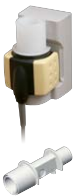
IRMA CO2 (CO 2 ) CAT.NO. 200101